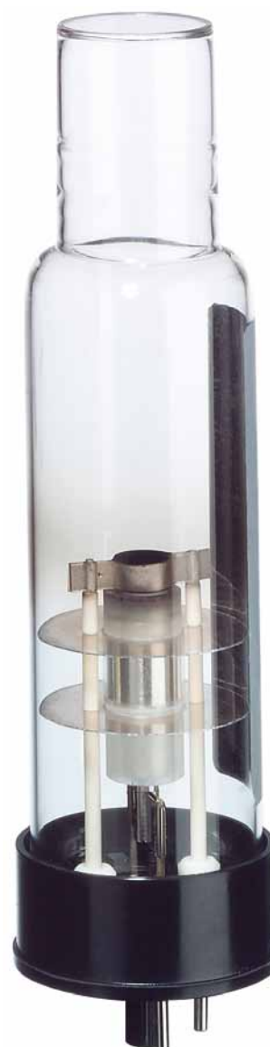
37 mm Hollow Cathode Lamp

Heraeus manufacture and supply a complete range of data coded hollow cathode lamps for Varian, Perkin Elmer and Thermo instruments.