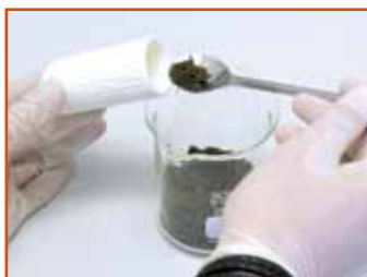
Analysis of soil contaminants

Extraction thimbles are often used in Soxhlet extractors or automated extractors. These are typically employed, where multiple extraction cycles are required to dissolve the desired compound. Extraction units equipped with MN extraction thimbles minimize the hands-on time and ensure a complete extraction .