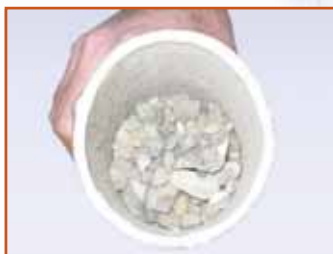
Determination of binder content in asphalt