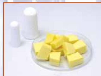
Fat determination in food and feed