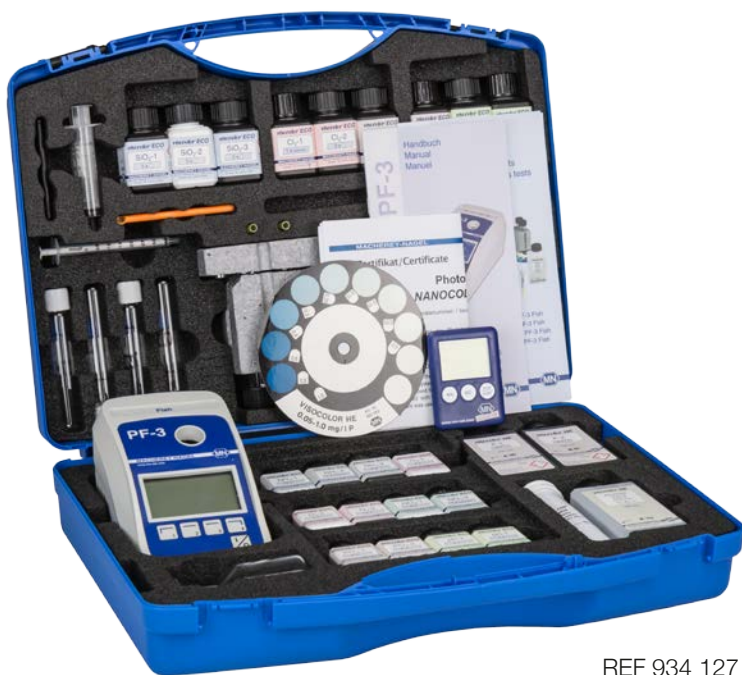
REF 934 127

For more information please visit www.mn-net.com/PF-3 .