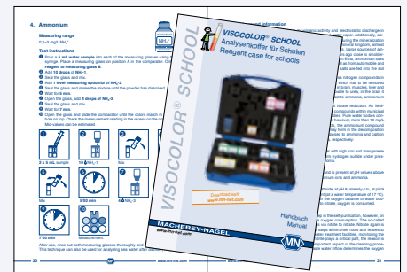
Extensive manual with valuable background information

Optionally, the case can be equipped with a pack of pH-Fix or QUANTOFIX® test strips as well.